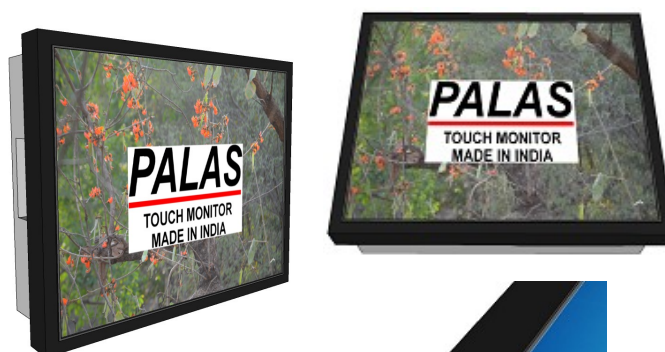
170BMxM-F (with flange) for panel mounting

Unique metal frame PCs for use in harsh environments. Rugged design. Easy mounting through VESA mounts. Smooth, easy-glide surface coating. Anti-reflective.